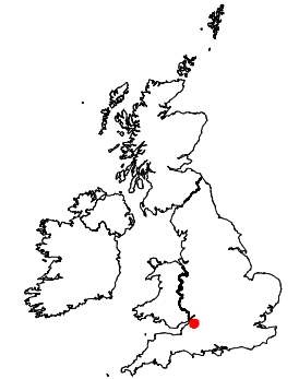
SITE LOCATION - NOT TO SCALE