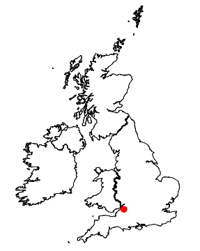
SITE LOCATION - NOT TO SCALE